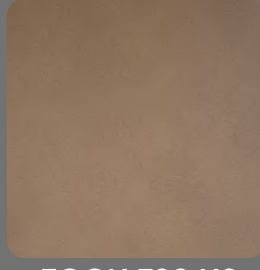
EGON 320 NS