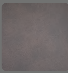
EGON 490 NS