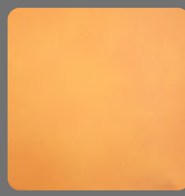
EGON 470 NS