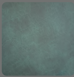
EGON 770 NS