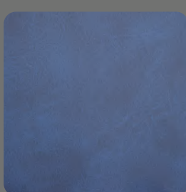
EGON 680 NS