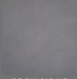
EGON 810 NS