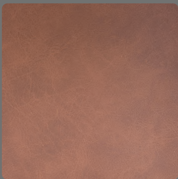
EGON 380 NS